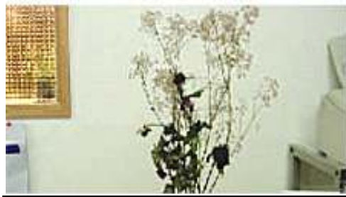
Dried flowers in the ordinary house

Another experiment was done to produce dried flowers from fresh flowers with the same stump. In the LOHAS studio fresh flowers became dry with vivid natural color ! In the ordinary house, flowers became dry as an usual kind of dried flowers. Their staff engaged in this experiment says he could not recognize the the ones in LOHAS Studio as "dried flowers" since the colour looked so natural.