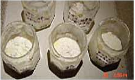
Bottles of milk in LOHAS studio

Another experiment was done to produce dried flowers from fresh flowers with the same stump. In the LOHAS studio fresh flowers became dry with vivid natural color ! In the ordinary house, flowers became dry as an usual kind of dried flowers. Their staff engaged in this experiment says he could not recognize the the ones in LOHAS Studio as "dried flowers" since the colour looked so natural.