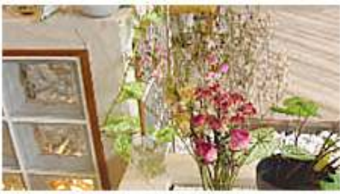
Dried flowers in LOHAS studio