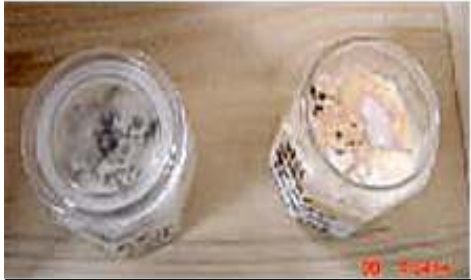
Bottles of milk in an ordinary house

At LOHAS studio with EM Diatomite (right) and ordinary house (left), bottles of a few kinds of milk were placed to find what would happen after that. In 3 weeks' time, the milk in the LOHAS studio changed to cheese, and the ones in the ordinary house became rotten with foul odor and fungus.